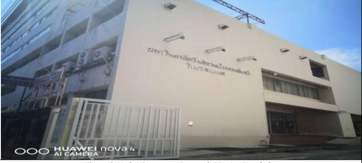
Figure 2. Yodse Campus at Pomprab District, Bangkok