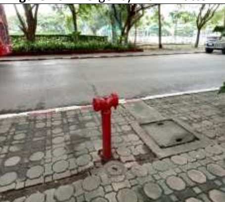
Figure 18 Fire Hydrant