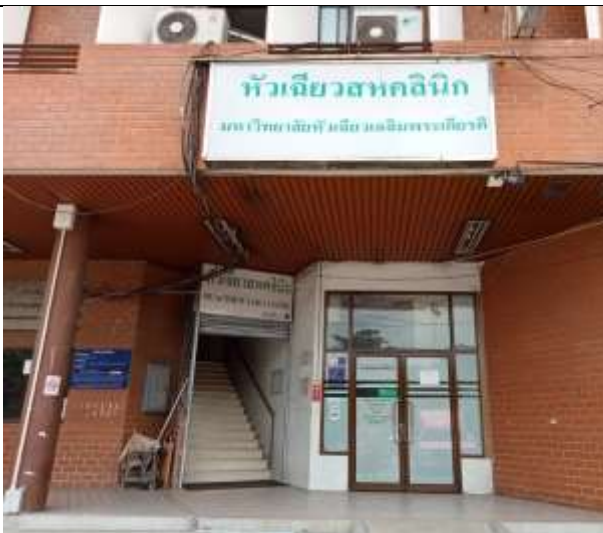
Figure 20 Huachiew Saha Clinic Entrance