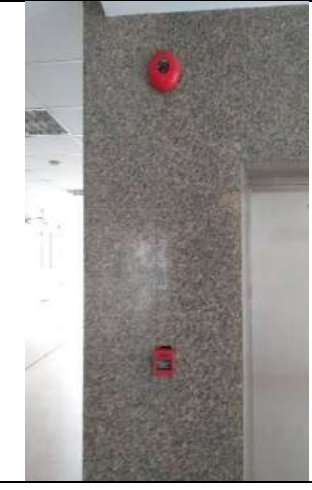
Figure 16 Emergency Alarm Button