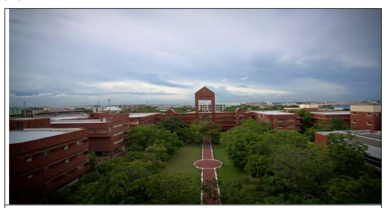
Figure 1. Main Campus at Bangplee District, Samutprakarn

The university has conservation projects in long-term conservation facilities, including the Organic Vegetable Project. This project is a non-chemical and pesticide-free vegetable growing project. All kinds of vegetables in this project are grown by the university's staff and grown in the university area. Food crops are grown for cooking food as well as Thai and Chinese herbs which are grown for selling to people and communities.