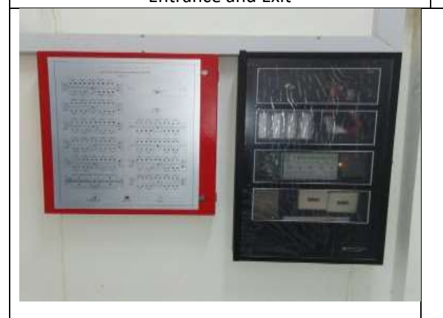
Figure 15 Fire Control Cabinet