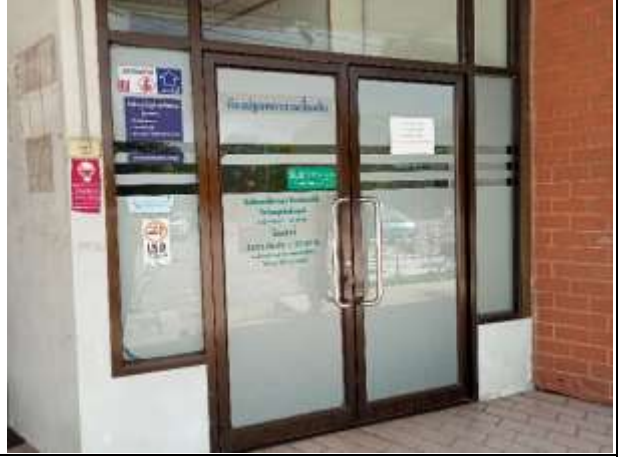
Figure 24 First Aid & Emergency Room