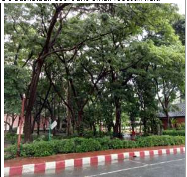
Figure 7 Forest Vegetation Area at HCU1