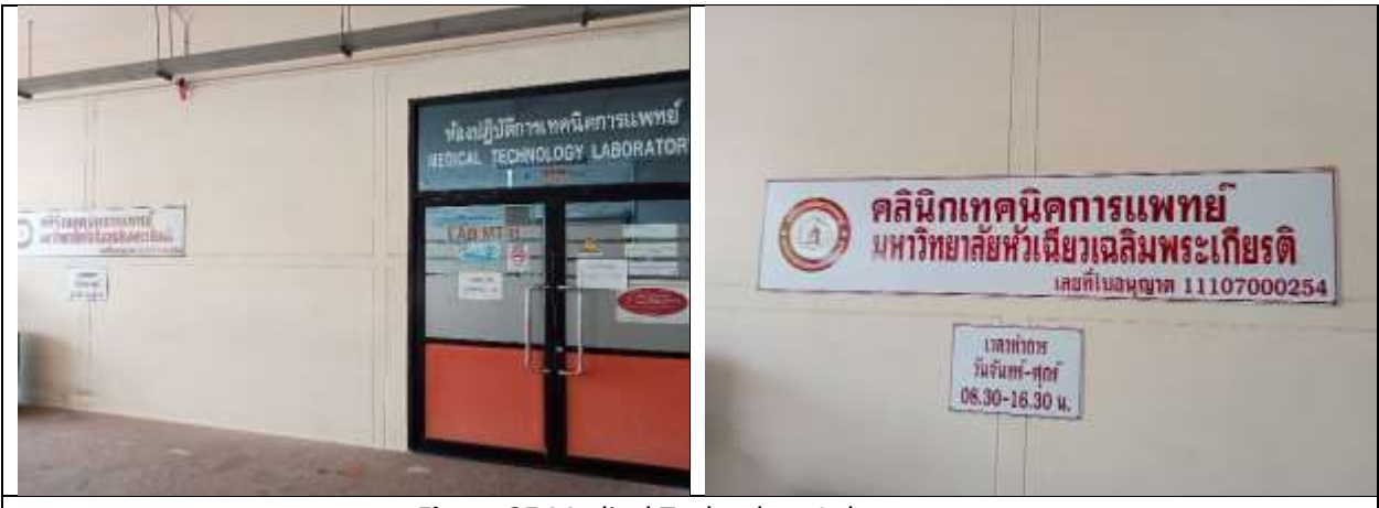
Figure 25 Medical Technology Laboratory