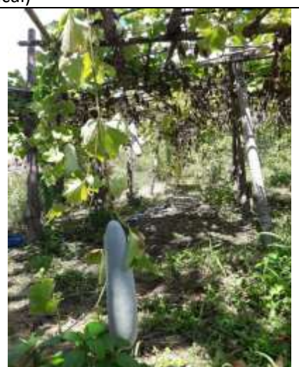
Figure 27 Plants in the field are food plants and herbs