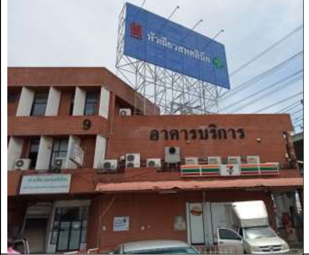
Figure 19 Huachiew Saha Clinic