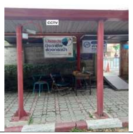
Figure 13 CCTV at Huachiew Chalermprakiet University' gate, inside the building and at Entrance and Exit