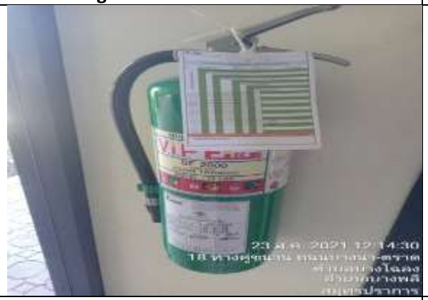
Figure 17 Fire Extinguisher BF 2000 (Non CFC)