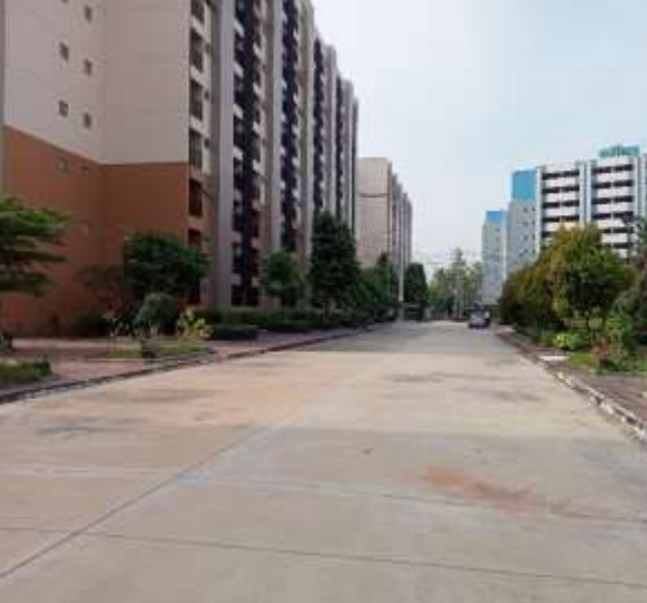
Figure 10 Area on campus for water absorption at HCU1, 2