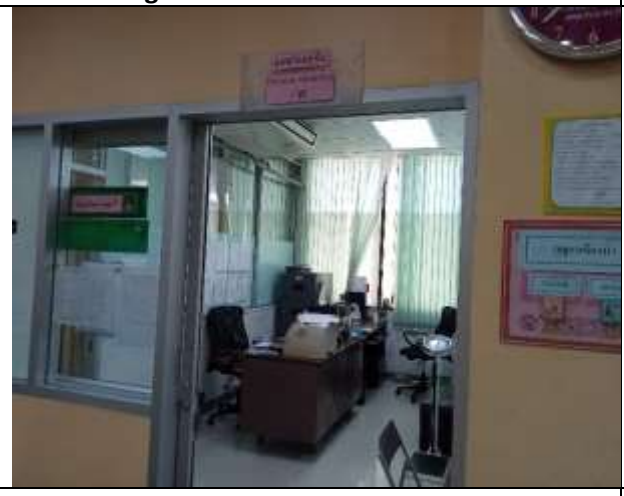
Figure 21 Traditional Chinese medicine services