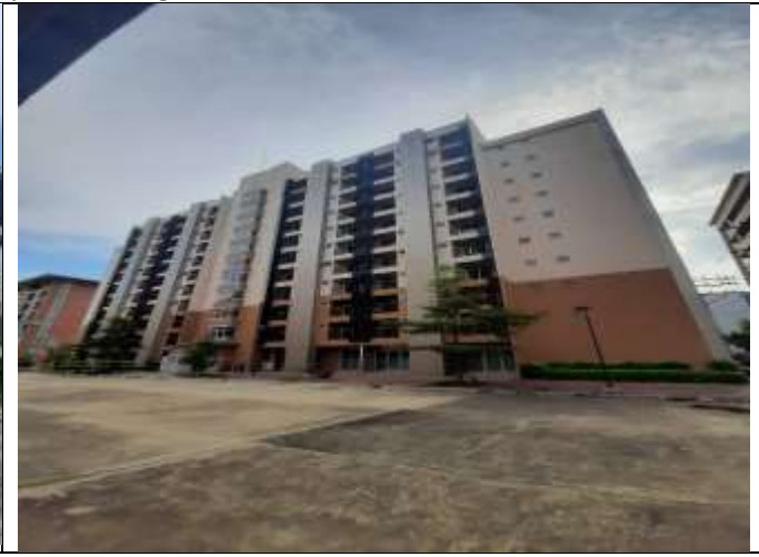
Figure 4. Campus Building Area at HCU2