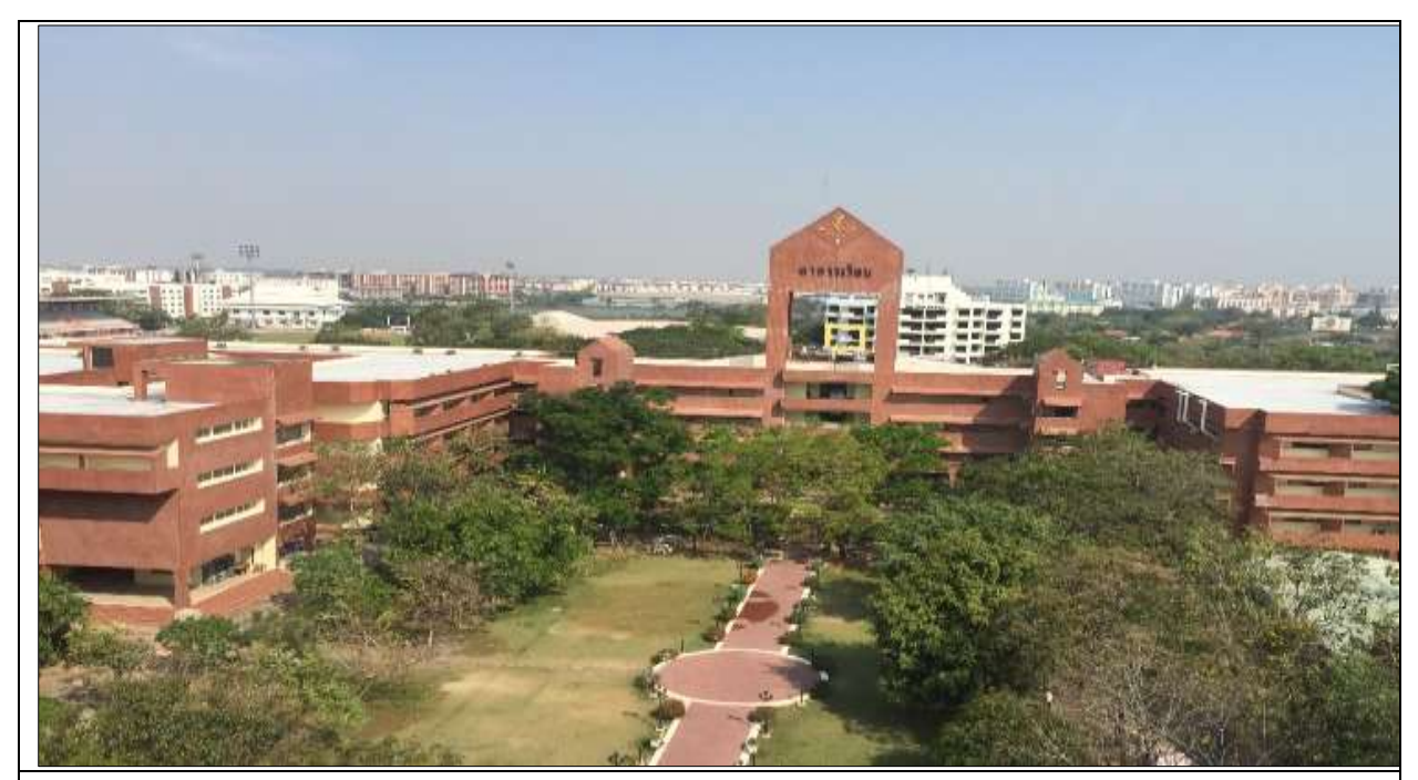
Figure 3. Campus Building Area at HCU1